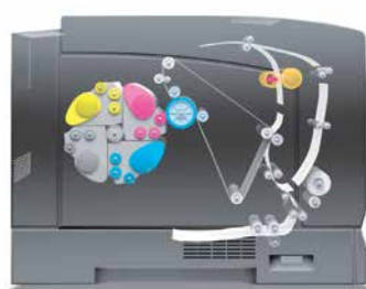
Conventional Toner particles

Proven Fuji Xerox "elasticity belt/lap transfer technology" and "EA toner" means perfect registration and transfer of toner to the paper. Not only does this deliver superb print quality, but it ensures that over 98% of toner is used for printing and that means less waste and less machine contamination from floating toner particles – it all adds up to greater reliability.