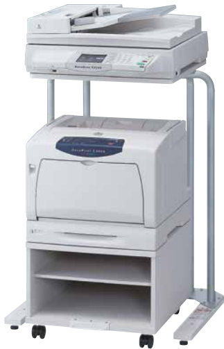
DocuPrint C3055DX shown with optional DocuScan C4250 scanner, stand and cabinet.