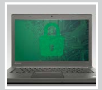
SIMPLIFIED USABILITY Intel® vPro™ makes security and management simple and easy