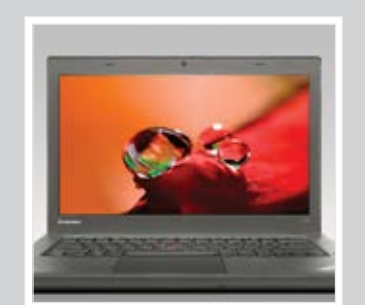
SUPERIOR DISPLAY 14" HD, HD+ screen with multitouch capability for clear and sharp visuals