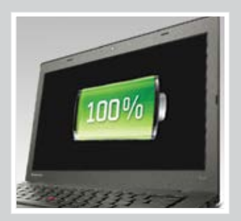
LONG-LASTING PERFORMANCE More than 10 hours of battery life*

Meet the Lenovo® ThinkPad® T440, a laptop whose every feature has been designed for your comfort. Take full advantage of Windows 8 with the 14" HD or HD+ screen with optional multitouch capability, and TrackPad that supports Windows 8 gestures.