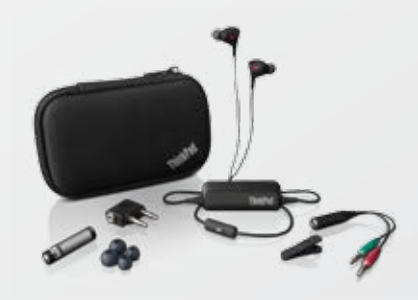
OB47313 ThinkPad Noise-Cancelling Earbuds

New ThinkPad docking for security, connection, and power