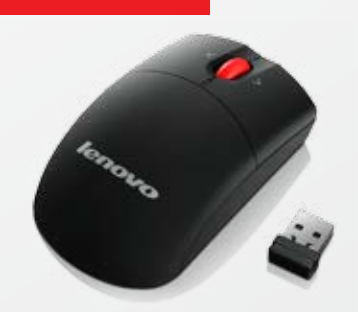
0A36188 Lenovo Laser Wireless mouse

A Case as Sophisticated as the ThinkPad Inside 0B47307 ThinkPad Ultralight Topload (14.1" ultrabook) 0B47306 ThinkPad Ultralight Backpack (14.1" ultrabook)