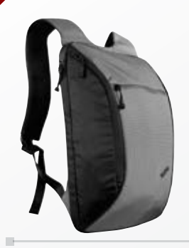
ThinkPad® Ultralight Topload and Backpack

A Case as Sophisticated as the ThinkPad Inside 0B47307 ThinkPad Ultralight Topload (14.1" ultrabook) 0B47306 ThinkPad Ultralight Backpack (14.1" ultrabook)