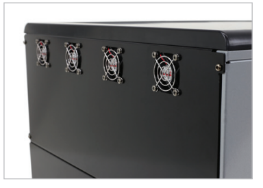
Continuous operating fans keep devices cool