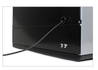
Ethernet cable routing hole in back wall