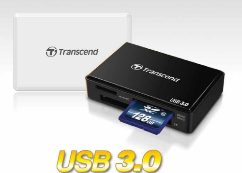
Utilize the full speed potential of your memory cards