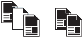
Image quality processing features