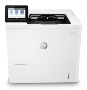
HP LaserJet Enterprise M612dn

This HP LaserJet Printer with JetIntelligence combines exceptional performance and energy efficiency with professional-quality documents right when you need them—all while protecting your network from attacks with the industry's deepest security.<sup>1</sup>