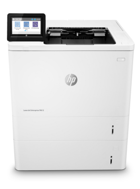
HP LaserJet Enterprise M612x