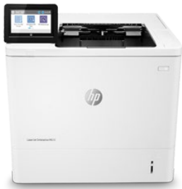
HP LaserJet Enterprise M612dn

This HP LaserJet Printer with JetIntelligence combines exceptional performance and energy efficiency with professional-quality documents right when you need them—all while protecting your network from attacks with the industry's deepest security. 1