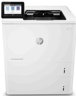
HP LaserJet Enterprise M612x