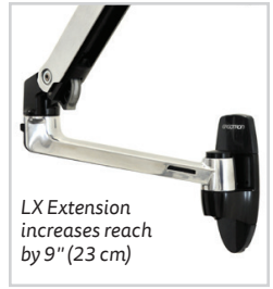
LX Extension increases reach by 9" (23 cm)

LX LCD Arm can be used without its extension or with a second 9" extension