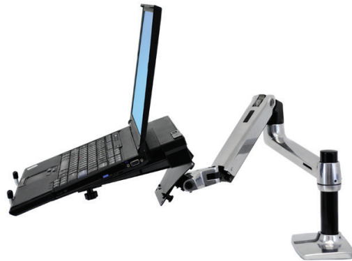
Add Notebook Tray (ordered separately, 50-193-200) to hold a laptop