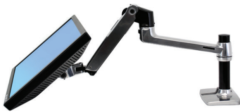
Ideal for users who wear bifocals