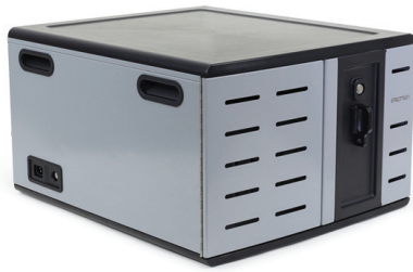
Zip12 Charging Desktop Cabinet