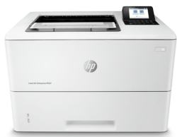
HP LaserJet Enterprise M507dn