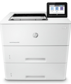
HP LaserJet Enterprise M507x