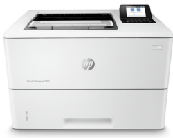
HP LaserJet Enterprise M507n

Choose an HP LaserJet Enterprise printer designed to handle business solutions securely and efficiently, and helps conserve energy with HP EcoSmart black toner. Keep up with the demands of growing business with a printer you can rely on.