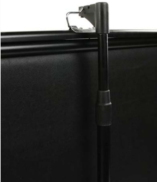
Self-contained light weight Aluminum Casing with telescoping bar and travel case allows this screen to be easily transported, set up and taken down.

ezCinema Series, Screens pull up from case and attach to an adjustable telescoping bar with variable height settings with a keystone adjustor. Solid rotating floor supports provide added stability.