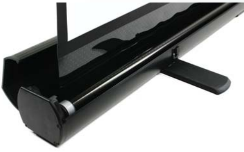
Details of the telescope bracket hook support and variable height setting