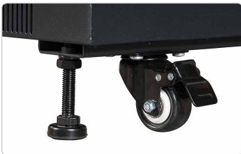
Pre-installed lockable castors and stabilising feet