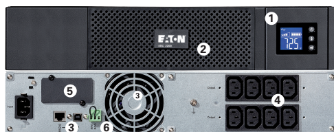
5SC 1500 Rack