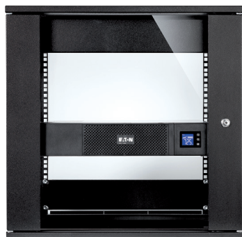
Short depth format for easy integration in small cabinets