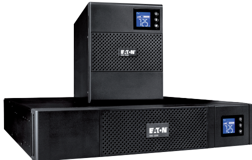
5SC is available in convenient compact form factors